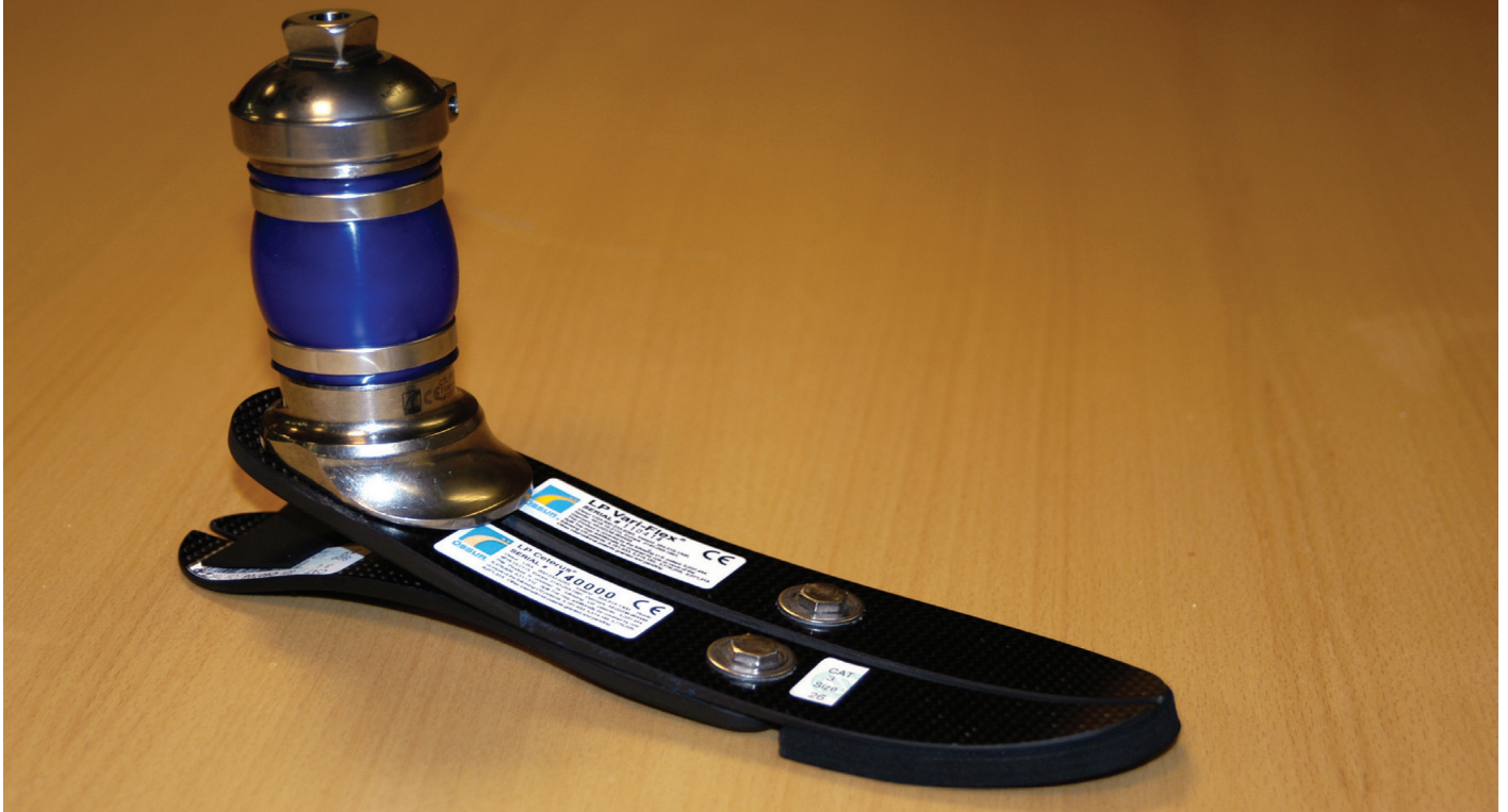
The Flex-Foot will be used by the world's fastest amputee Marlon Shirley in the Olympic Games, Athens 2004.

Össur product line represents the best in modern prosthetics and orthotics. The carbon fiber Flex-Foot is synonymous with high performance. Familiar to millions through the achievements of Paralympic athletes, the special properties of the Flex-Foot are equally outstanding for daily use and different activity levels.