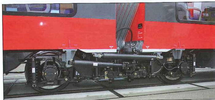
The Talent 2 runs on bogies from the Flex-Compact family, like those on which the AGC and Spacium are mounted. The primary suspension system comprises rubber bushes and steel springs with a vertical shock absorber on its outer side.