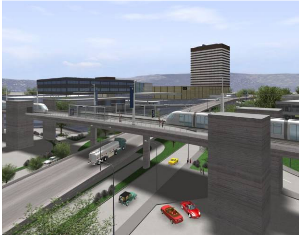
ARGE Gestaltung Glattalbahn – Ernst Basler + Partner AG, Feddersen & Klostermann und Nicolas Grimshaw & Partners Ltd. / Mathys AGV, Zurich

ABB has won the turnkey contract in co-operation with Implenia and Walo Bertschinger for traction power supply and power distribution systems for the Glattalbahn light rail, Zurich.